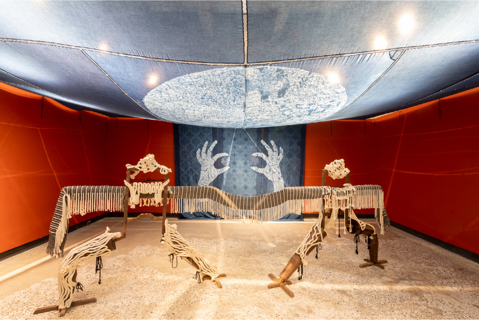
Image Credit: Akash Inbakumar, Era of the Moon: Phases , 2023. Installation detail, Art Gallery of Burlington. Courtesy of the artist. Photo credit: Jimmy Limit.