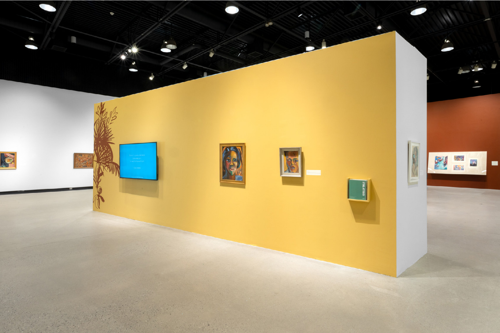
Sybil Atteck, Art Gallery of Burlington, 2023.