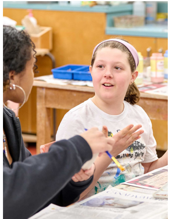
Image Credit: March Break Camps, Art Gallery of Burlington. 2024.