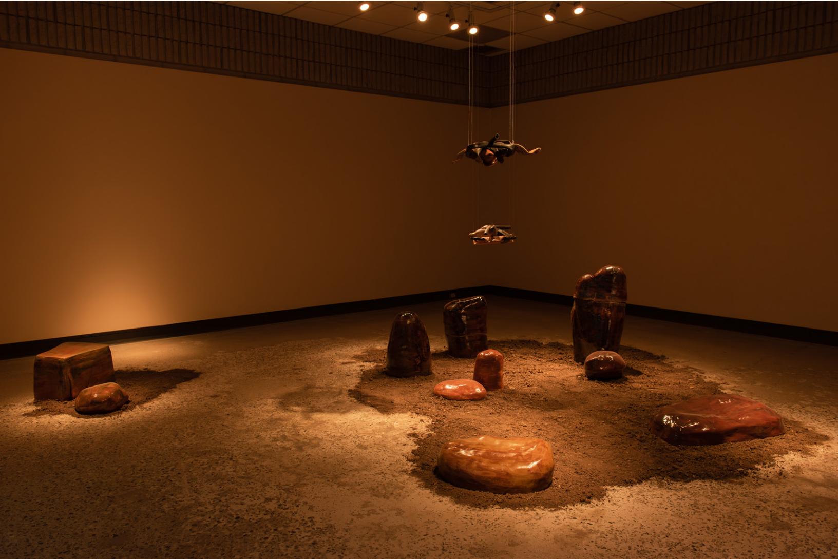
Image Credit: Chiedza Pasipanodya, Ndafunga Dande (Thoughts of Home) , 2023. Installation detail, Art Gallery of Burlington. Courtesy of the artist. Photo credit: Roya DelSol.