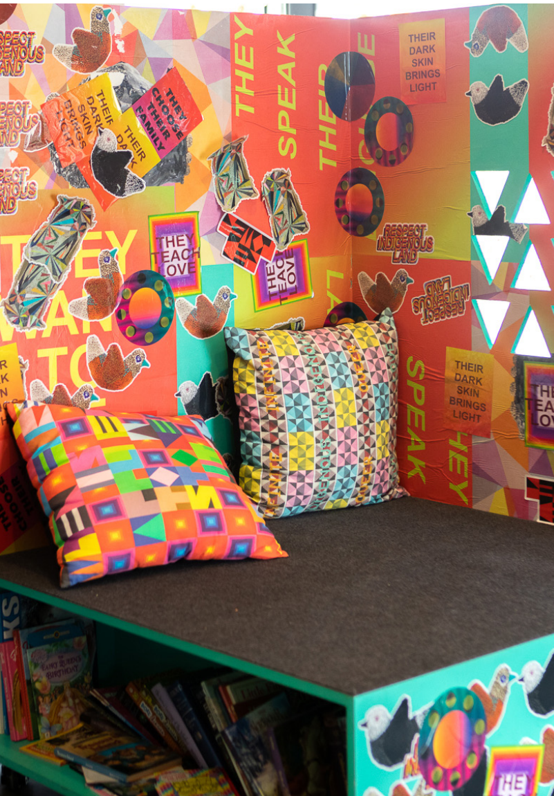
Image Credit: Jeffrey Gibson, I AM YOUR RELATIVE, 2022. Co-commissioned by MOCA Toronto and the Toronto Biennial of Art. Courtesy of Jeffrey Gibson Studio, Kavi Gupta Gallery, Roberts Projects, Sikkema Jenkins & Co., and Stephen Friedman Gallery, Living Library installation detail, 2023. Art Gallery of Burlington.