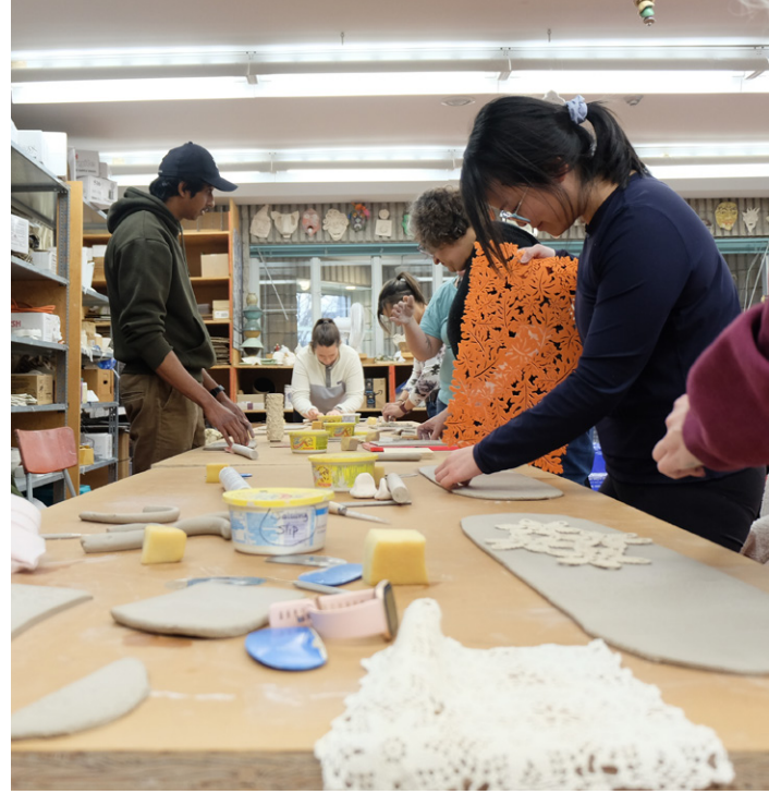
Image Credit: JBH Health Care Workers, Reclaiming Clay Workshop, 2023.