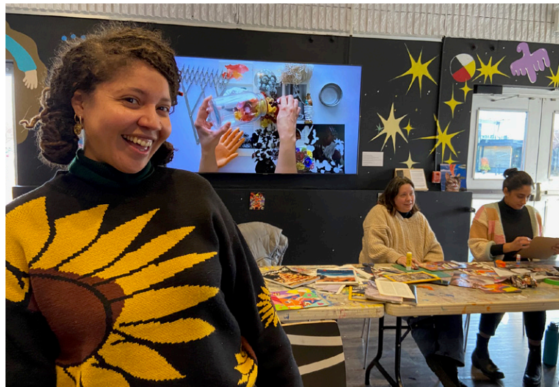
Image Credit: Natalie King, a soft place to daydream , Living Library , mural installation detail, 2023. Art Gallery of Burlington. Photo credit: Jimmy Limit.