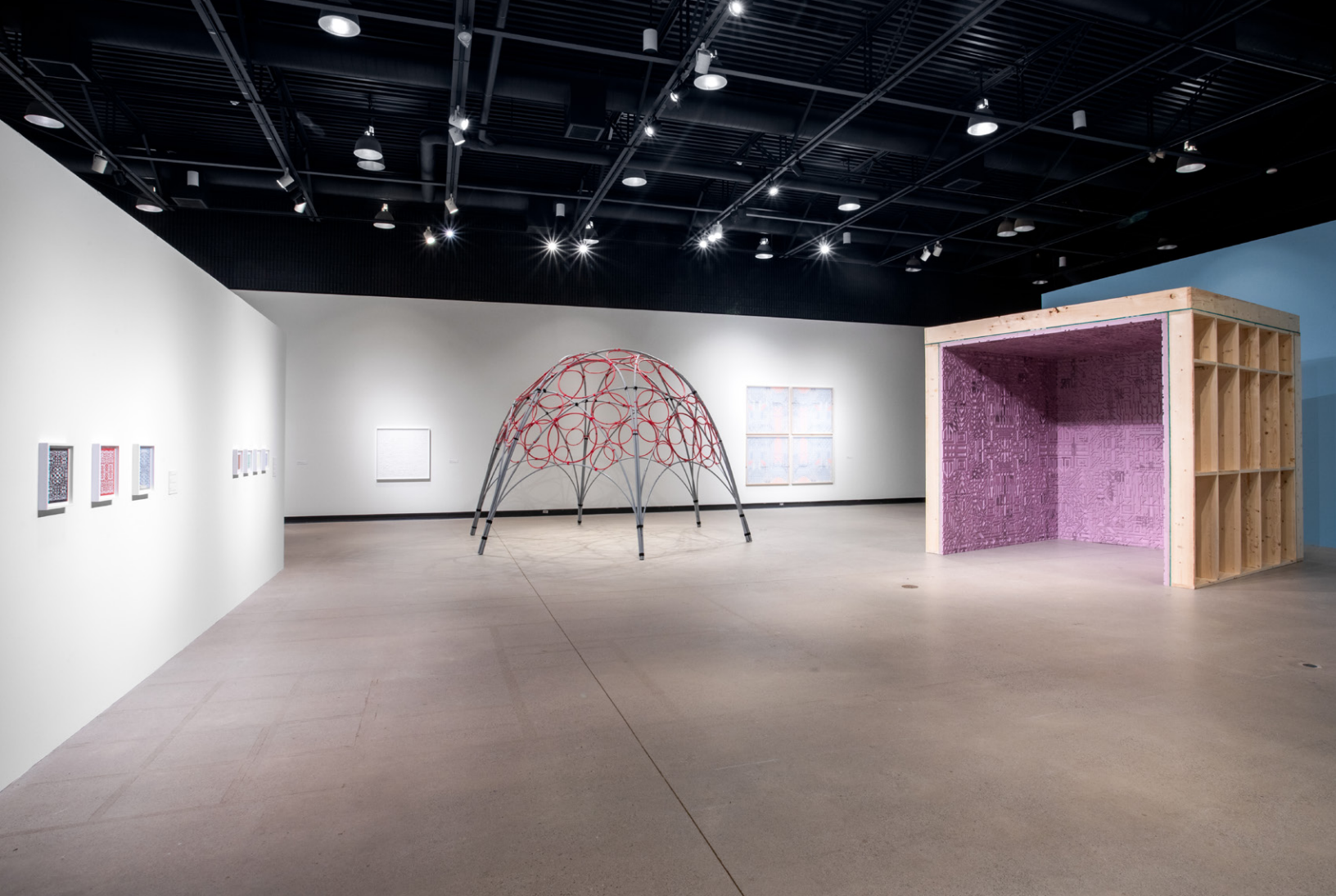
Image Credit: Caroline Monnet, Holding up the Sky , 2023. Installation detail, Art Gallery of Burlington. Courtesy of the artist. Photo credit: Jimmy Limit.