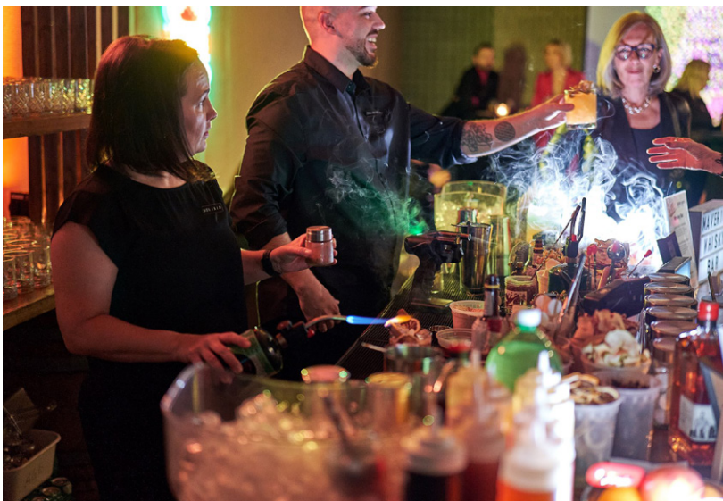
Image Credit: (top) Tyler Matheson, i found utopia on the dancefloor . beach balls, plaster, tiled mirrors, pvc pipe, spray paint, 6'x28"x28". Art Gallery of Burlington. Courtesy of the artist. Photo credit: Suzanne Carte