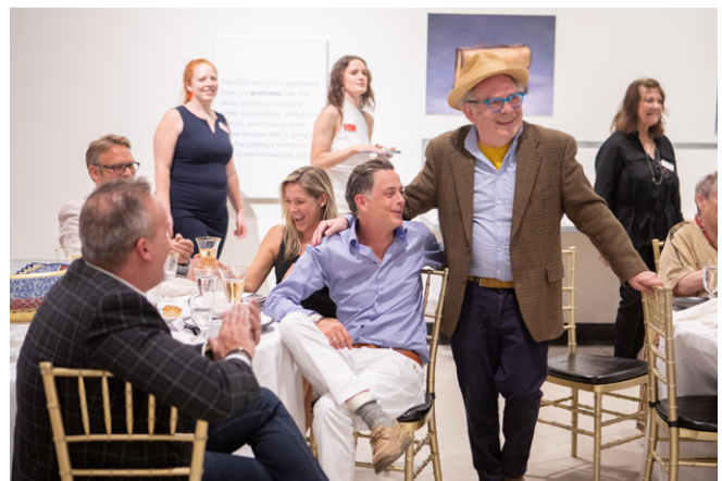
Image Credit: Patrons Dinner, Art Gallery of Burlington, 2023.