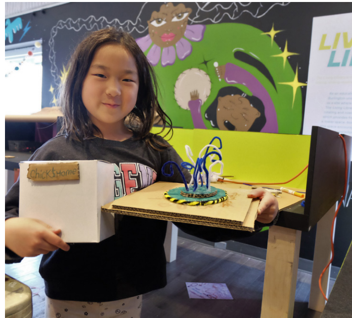
Image Credit: Burlington Waterfront Sculpture Trail Family Open Studio, Art Gallery of Burlington, 2023. Photo Credit: Annie Webber.